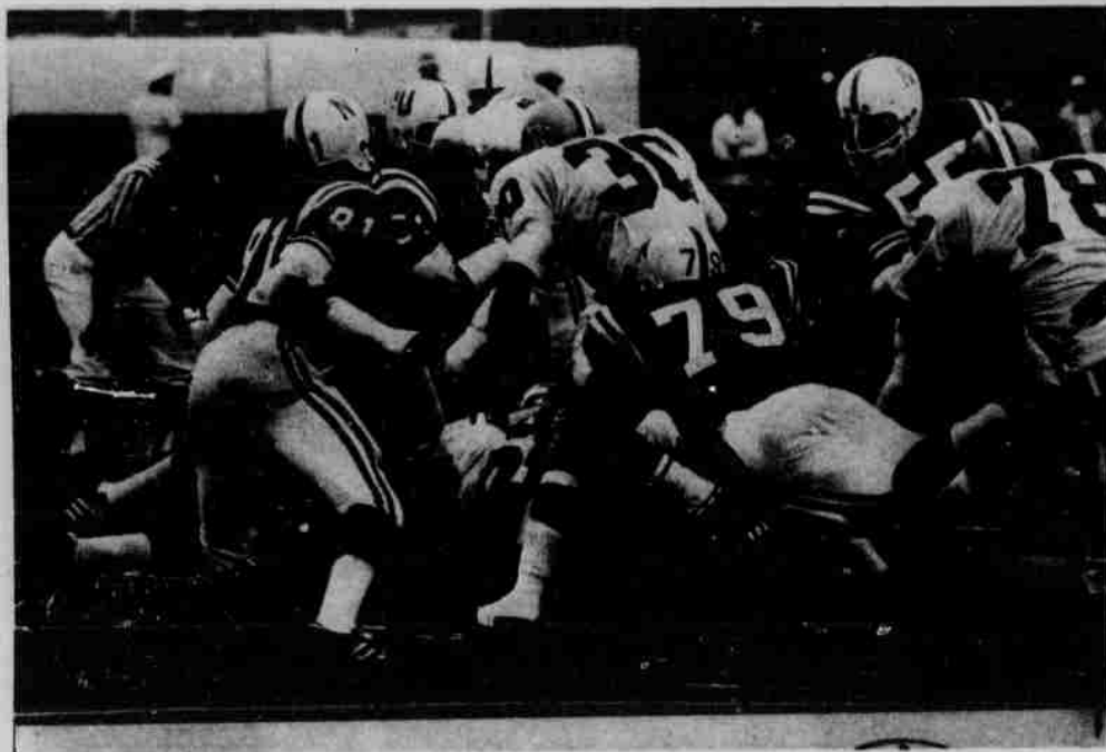
Flying tackle...Nebraska's Rich Glover (79) stops elusive Ernie Cook.