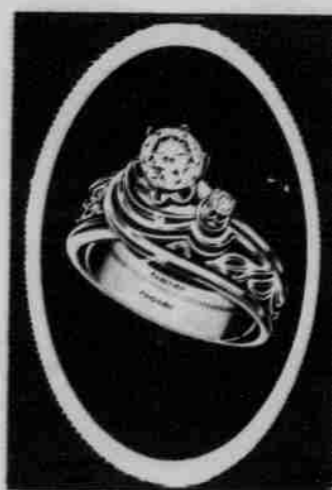
MARINA $300 TO $400 WEDDING RING $4.75