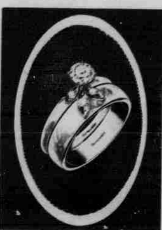
LORELEI $250 WEDDING RING $4.75