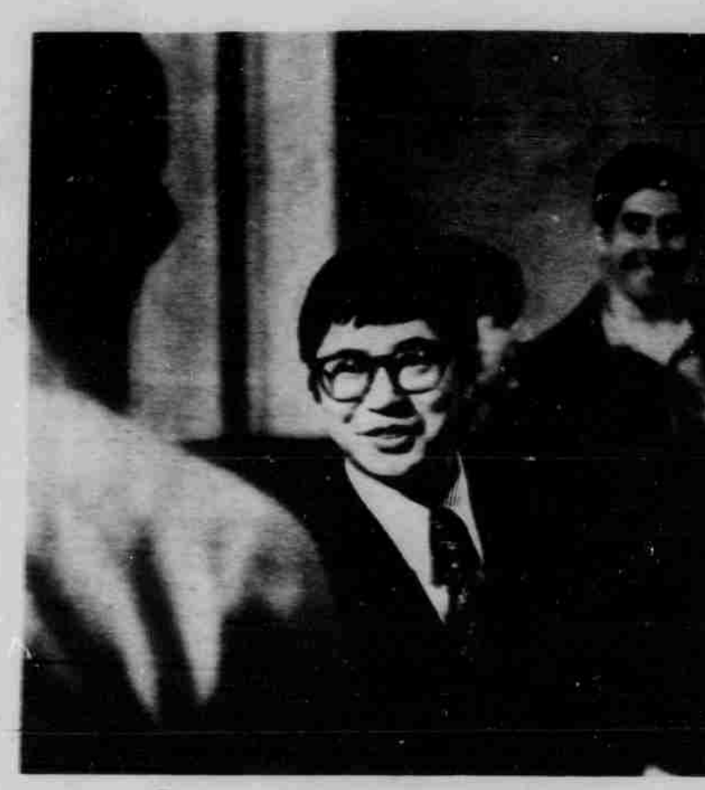
Tung. ... Vietnam does its share.

According to Tung three of the four military regions in