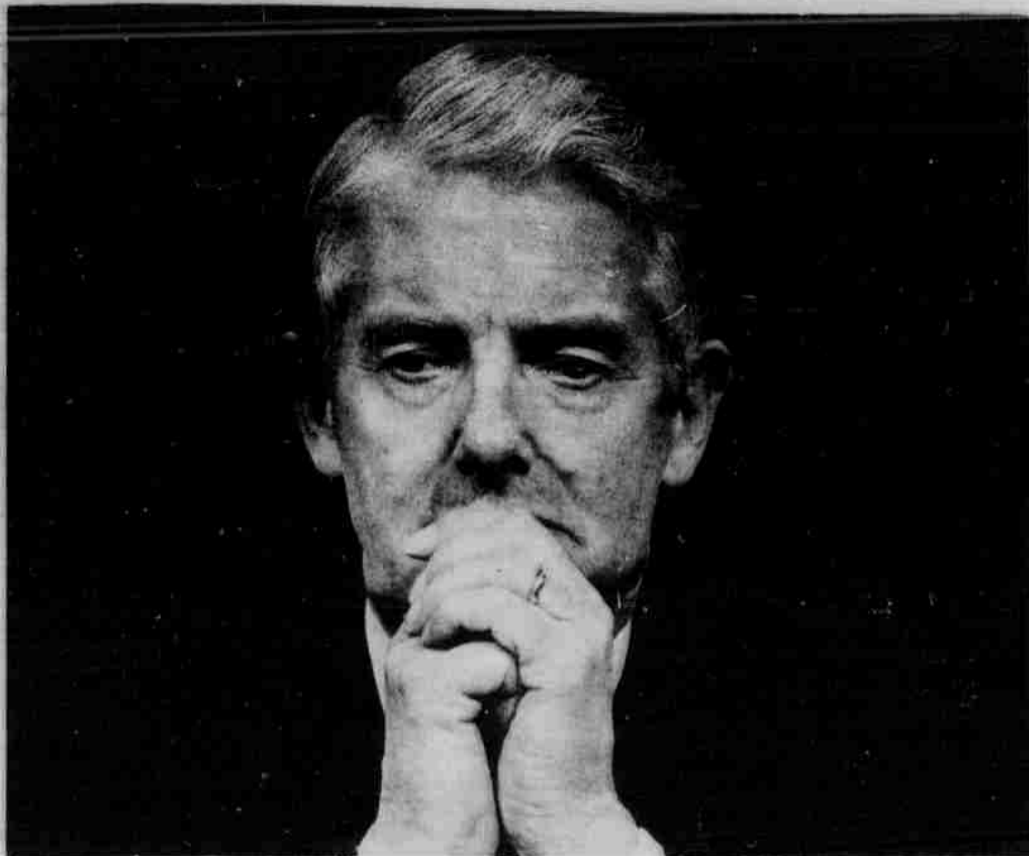
Conservationist Brower... "If we don't change our course, we won't have to worry about the 1980's."