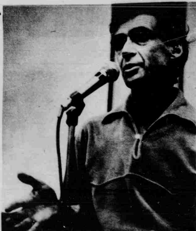
Soleri . . . Man has the potential of doing the wrong thing very well.

Man the animal is opposite to the vegetable as an organism says Soleri, because the vegetable needs space to spread out in to grow and man is able to derive his energy from the packaged entity, not needing the space.