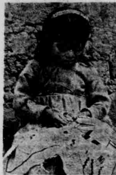
An artisan . . . works for the Latin American Project Endeavor.

All other profits go to the participating South and Latin American cooperatives.