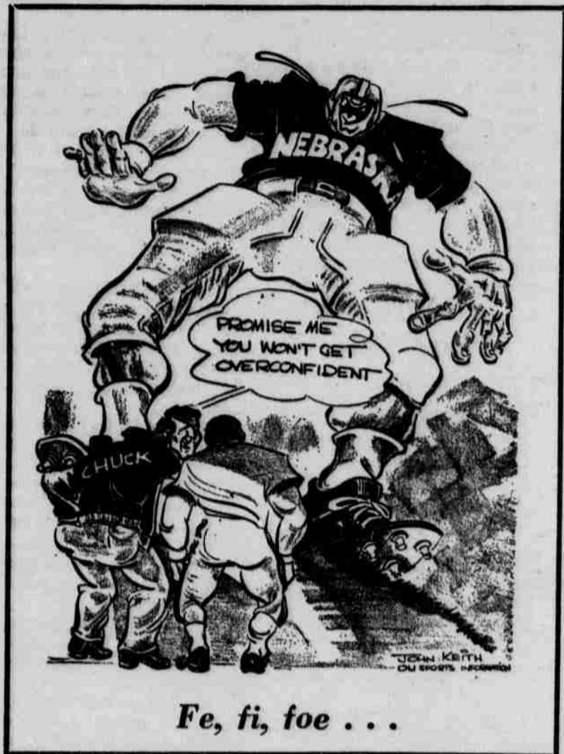
Fe, fi, foe . . .

This week the pressure is on the defensive line.