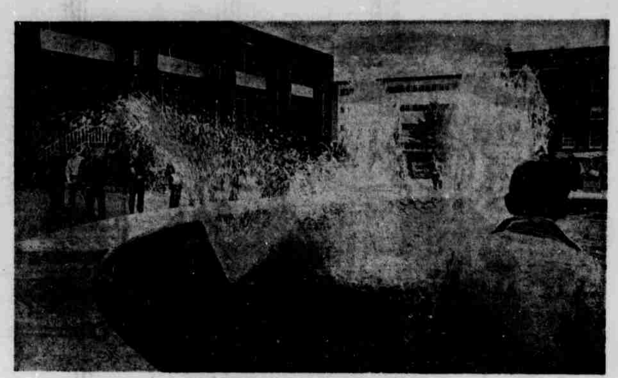
What if it freezes?