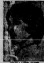
"THE LAYER CUT"