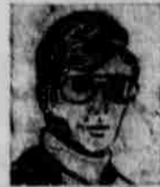
"WHERE IT'S AT"