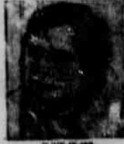
"LIKE IT IS"