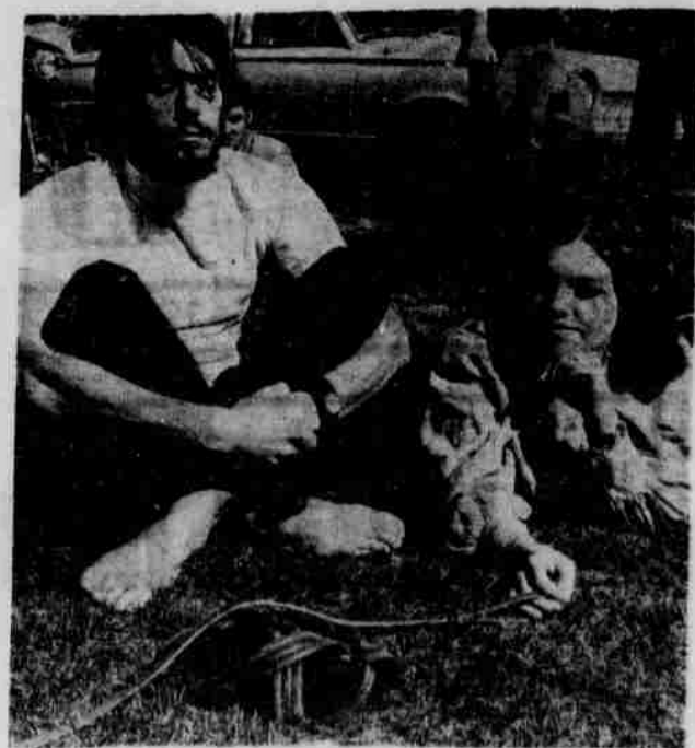
The war movement dissolves in the spring sunshine to melodious strains of the Farm Security Administration and the pungent odor of sweet-smelling grass and flowers at wonderwul, winsome Pioneer Park Wednesday.