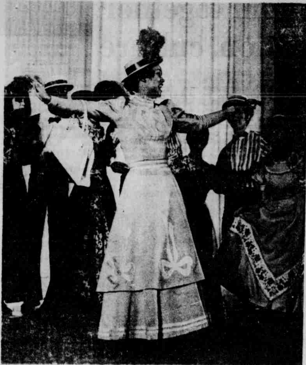
A scene from "Hello Dolly" to be presented Saturday and Sunday.