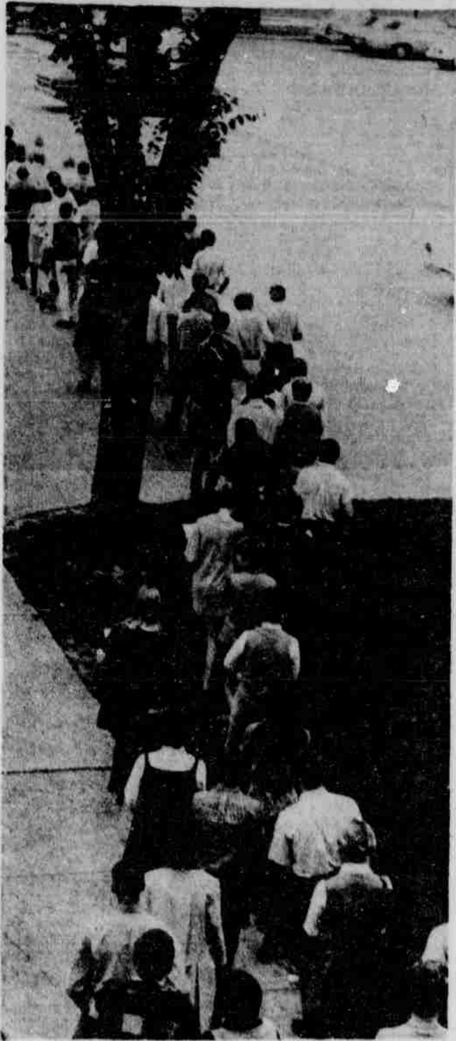
The line stretched for two blocks Monday as returning city campus students waited for permits to repair class schedules.