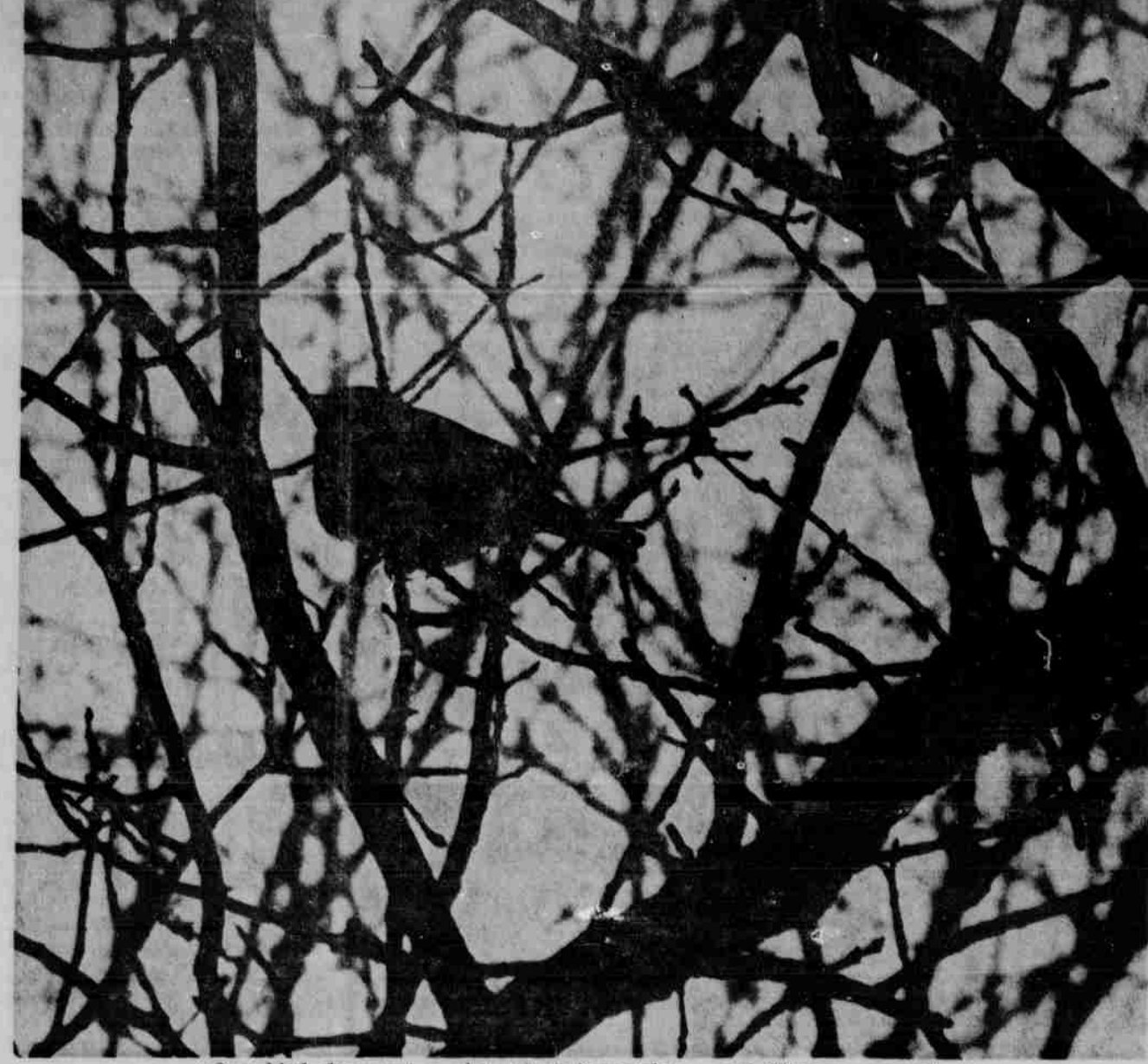
One bird does not a sign of spring make - old Chinese proverb.

LAST WORDS — Fencing stars, remember the co-recreational fencing club's organizatiosal meeting at 7 p.m. Tuesday in 301 Women's P.E. Building. It's a worthwhile club.