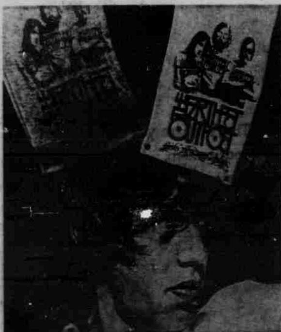
Soul Sisters: a Girls Town nun brings a flock of young people.