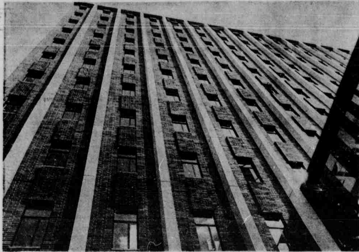
Oldfather Hall, one of the University's most recent additions, heightens campus scenery.