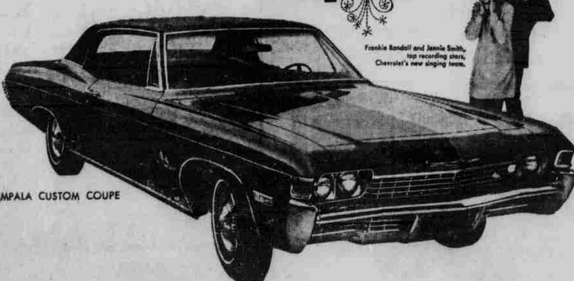
IMPALA CUSTOM COUPE