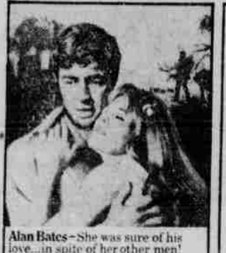
Alan Bates—She was sure of his love...in spite of her other men!

"Zhivago's" Lara meets "Georgy Girl's" guy...in the love story of the year!