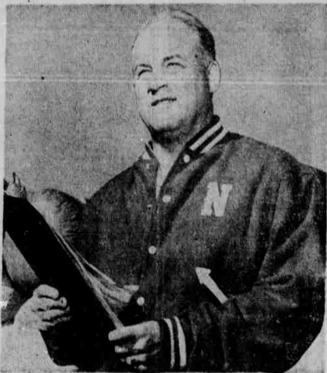
Bob Devaney . . . best in the West.

It was a coincidence that the last previous conference championship won by the Aggies occurred in 1956 when Gene was an end and the captain of a great team coached by Bear Bryant. Before graduation, Stallings had determined upon coaching as a career. He began as coach of the