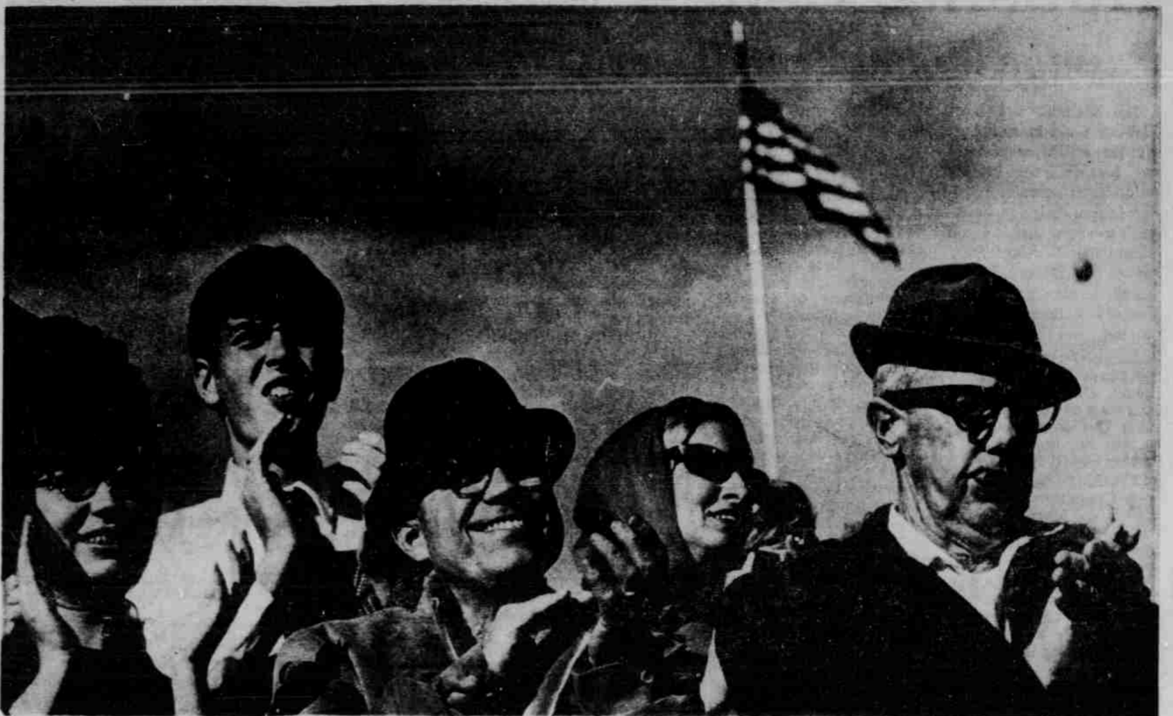
NEBRASKA FANS . . . react in varied ways to the action on the football field.