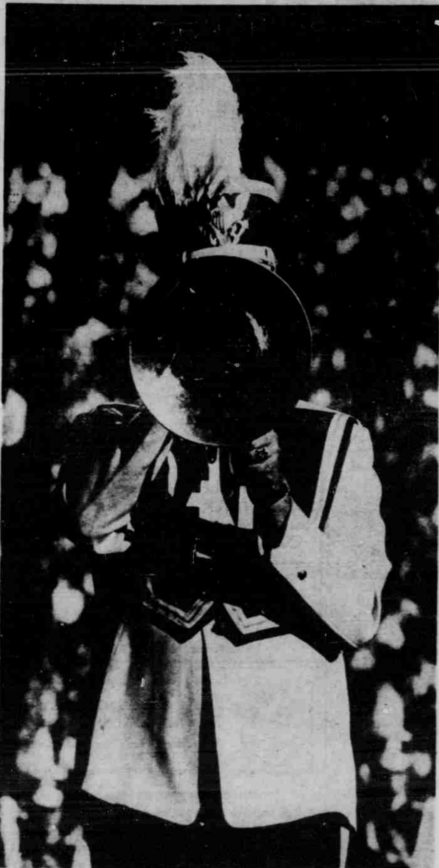
LET'S FACE IT . . . NU band performs superbly at Homecoming halftime.