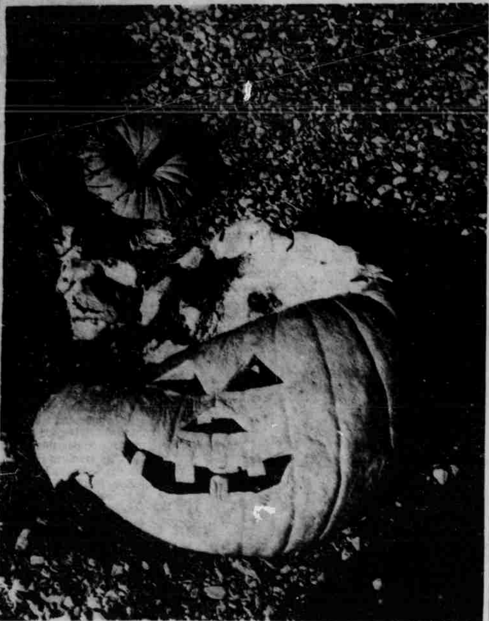
Great Pumpkin Takes Crash Landing