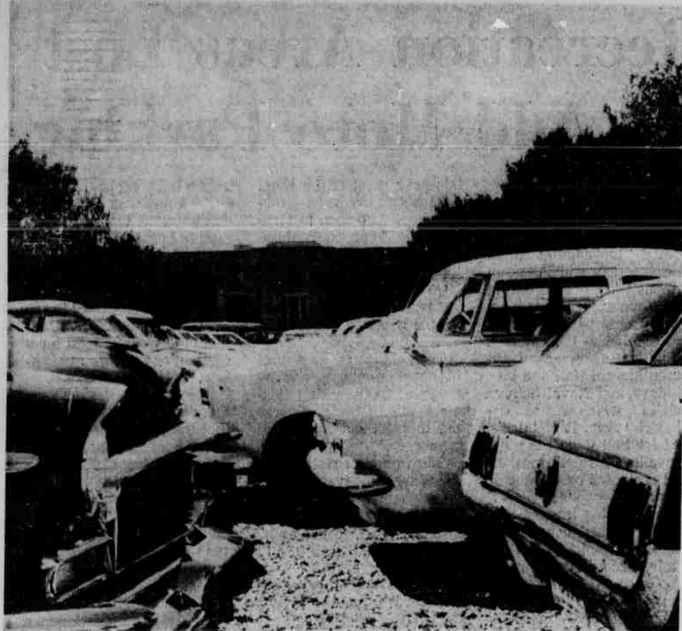
CARS AND CRUSHED ROCK . . . replace footballs and grass on the Stadium Mall.