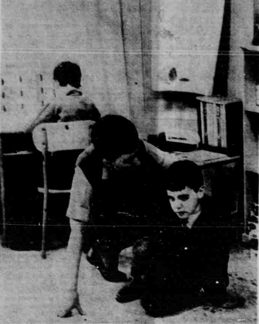
A teacher helps a boy overcome his personal nightmare when N.E.T. JOURNAL presents "Search for the Lost Self." The program was filmed at the League School for Seriously Disturbed Children in Brooklyn, New York.

trip to watch glassblowers at work, (N.E.T.) 12:15 THE FRIENDLY GIANT 12:30 ANIMALS OF THE SEASHORE RATO clams and other inhabitants of exposed sandy beaches are featured in today's program. (N.E.T.)