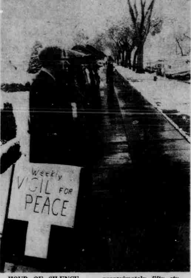
HOUR OF SILENCE . ... approximately fifty students, professors, and Lincoln residents took part in an hour vigil for peace in Victnam near Love Library Wednesday noon. The demonstration was sponsored by the United Campus Christian Fellowship.

The Council also recommended that the dress-up regulation at certain meals be changed to a recommendation that will be published in the Cather Hall