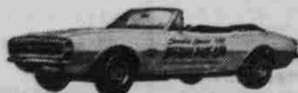
CAMARO CHOSEN 1967 INDIANAPOLIS 500 PACE CAR

Now, during the sale, the special hood stripe and floor-mounted shift for the 3-speed transmission are available at no extra cost! See your Chevrolet dealer now and save!