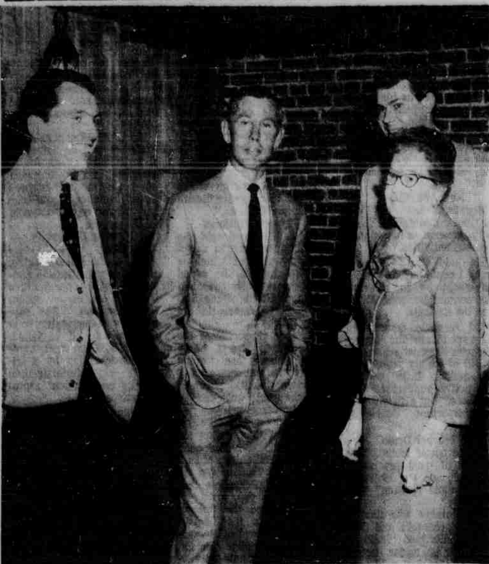
JOHNNY CARSON . . . meets with the housemother and members of his college fraternity, Phi Gamma Delta, on a visit to Nebraska during which he hosted Nebraska's Show of the Century.