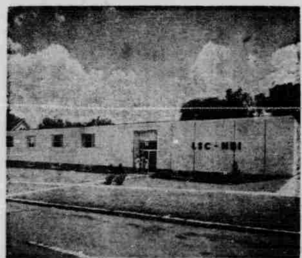
LSC-NBI Building 1821 "K" Street, Lincoln, Nebraska