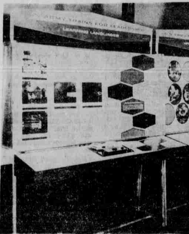
ARMY EDUCATION . . . Display presents new army training and educational opportunities.

An exhibit called "U.S. Trains for Leadership" is being presented at the Nebraska Union from 9 a.m. to 9 p.m. Thursday and Friday.