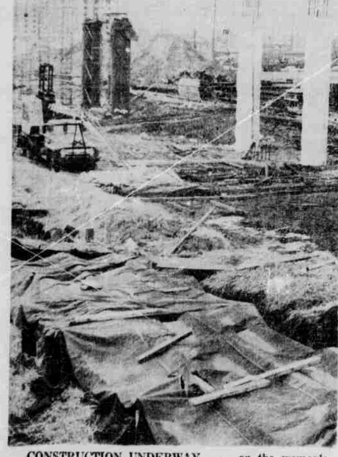
CONSTRUCTION UNDERWAY . . . on the women's new physical education building which is expected to boost women's sports participation.

Write: TEACHERS FOR WEST AFRICA PROGRAM Elizabethtown College, Elizabethtown, Pa. 17022