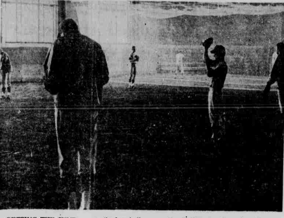
GETTING THE JUMP . on the baseball season, Cornhusker squad members loosen up in the Field House, while waiting for the spring thaw. Nebraska journeys to Houston, March 27, for their first game.