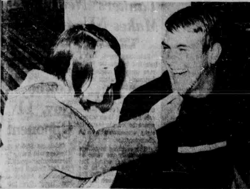
"YOU TOO?" ... is a question being raised more and more often every day as coeds view the influx of Centennial-inspired beards.