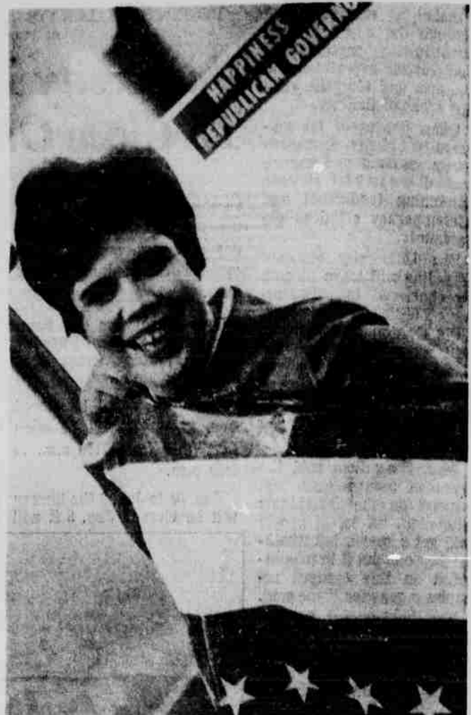
HAPPINESS.. for a YR president is a GOP victory.