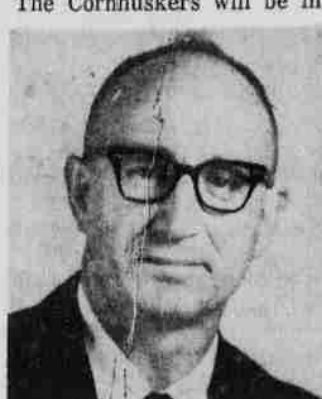
braska swimming coach.

Conference tank teams, with the exception of Colorado, will enter the tournament in up to 12 events. The Cornhuskers will be in