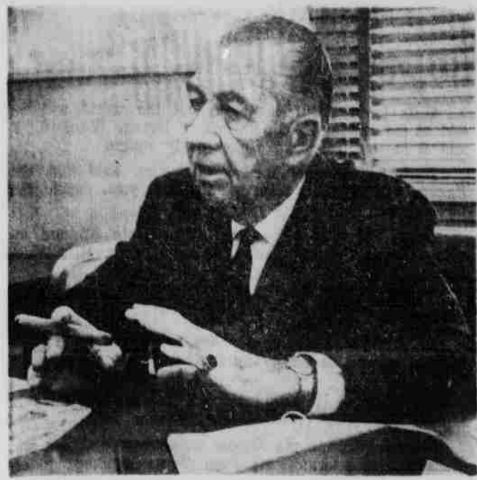
COLONEL FRANCIS DRATH . . . says the draft will not take students until June, at least.