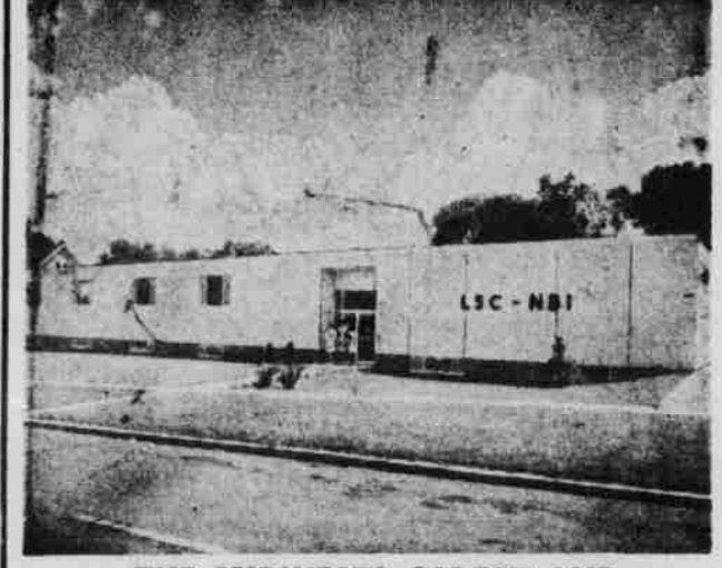
THE MIDWESTS OLDEST AND MOST MODERN BUSINESS COLLEGE FACILITY

INSTRUMENTATION SPECIALTIES CO., INC. 5624 Seward Avenue, Lincoln, Nebraska