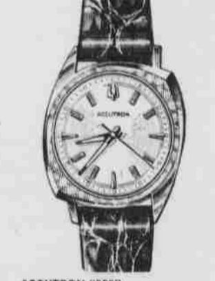
ACCUTRON "223" Stainless-steel case, luminous dots and hands, applied markers on dial, alligator strap, $125.00

For the same reason he does. So you can tell what time it is. Precisely. The Accutron movement is used in Explorer, Telstar, TIROS and Pegasus satellites, as well as Gemini. The vibrations of a tiny tuning fork divide each second into 360 equal parts.