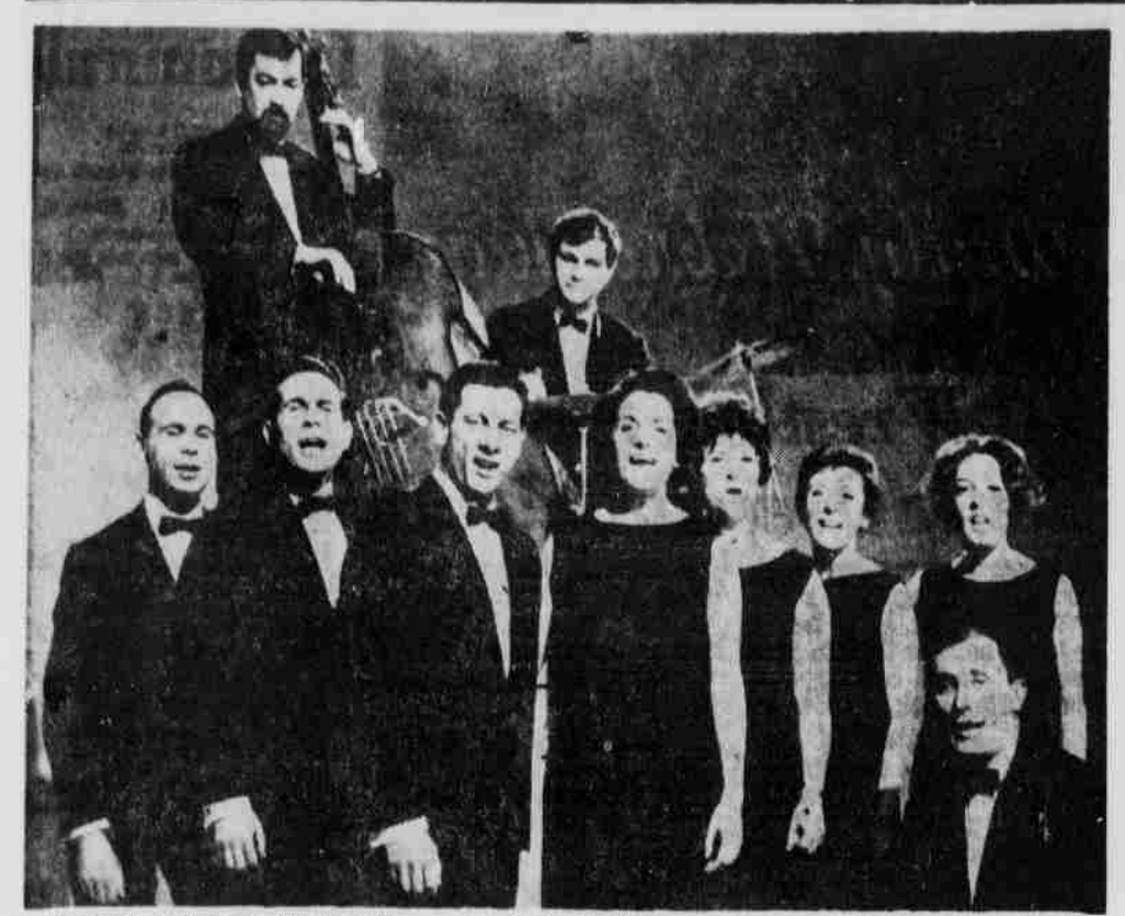
SWINGING THE CLASSICS . . . the Swingle Singers will acquaint Nebraska students with their unique stylings.