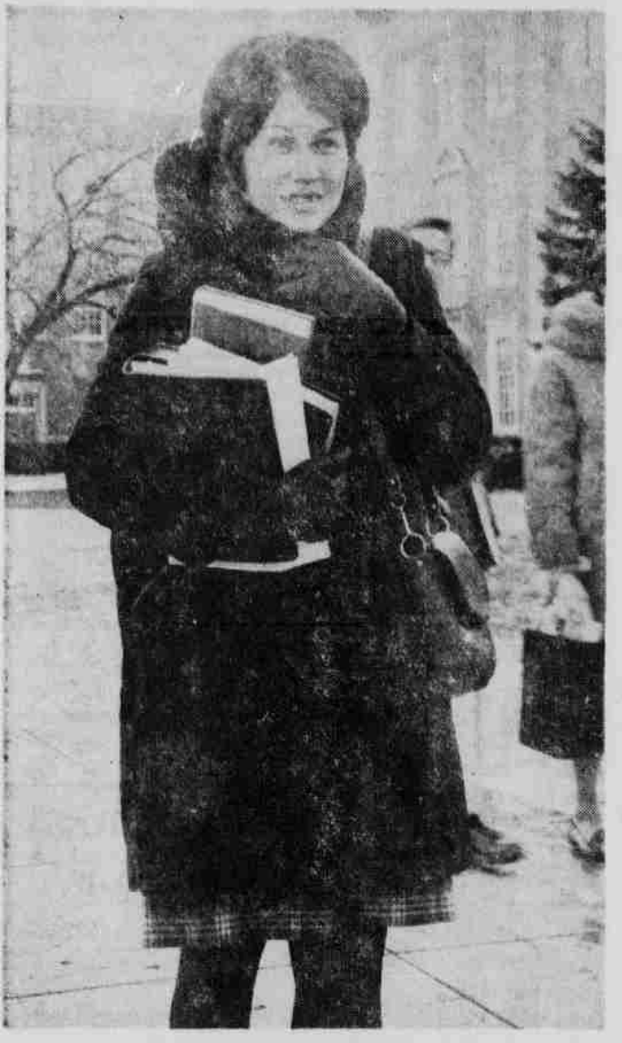
BUTTON UP YOUR OVERCOAT . . . coed models typical Nebraska winter attire.

Construction will begin as soon as the University