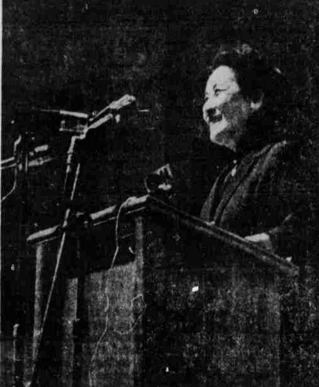
MADAME CHIANG . . . at Wesleyan's Arts Center.