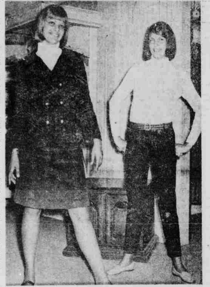
The military (left) and Carneby (right) looks are the biggest thing in fall fashions. The brass-buttoned double-breasted jacket shows the military influence. The striped belt and hip-hugger are part of the Carneby look.