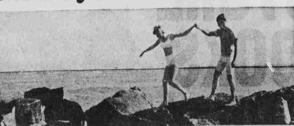
When you go where the fun is, don't bring losable cash. Bring First National City Travelers checks. You can cash them all over the U.S. and abroad. But their big advantage is a faster refund system. See below.

National City travelers checks, can be cashed all over the world.