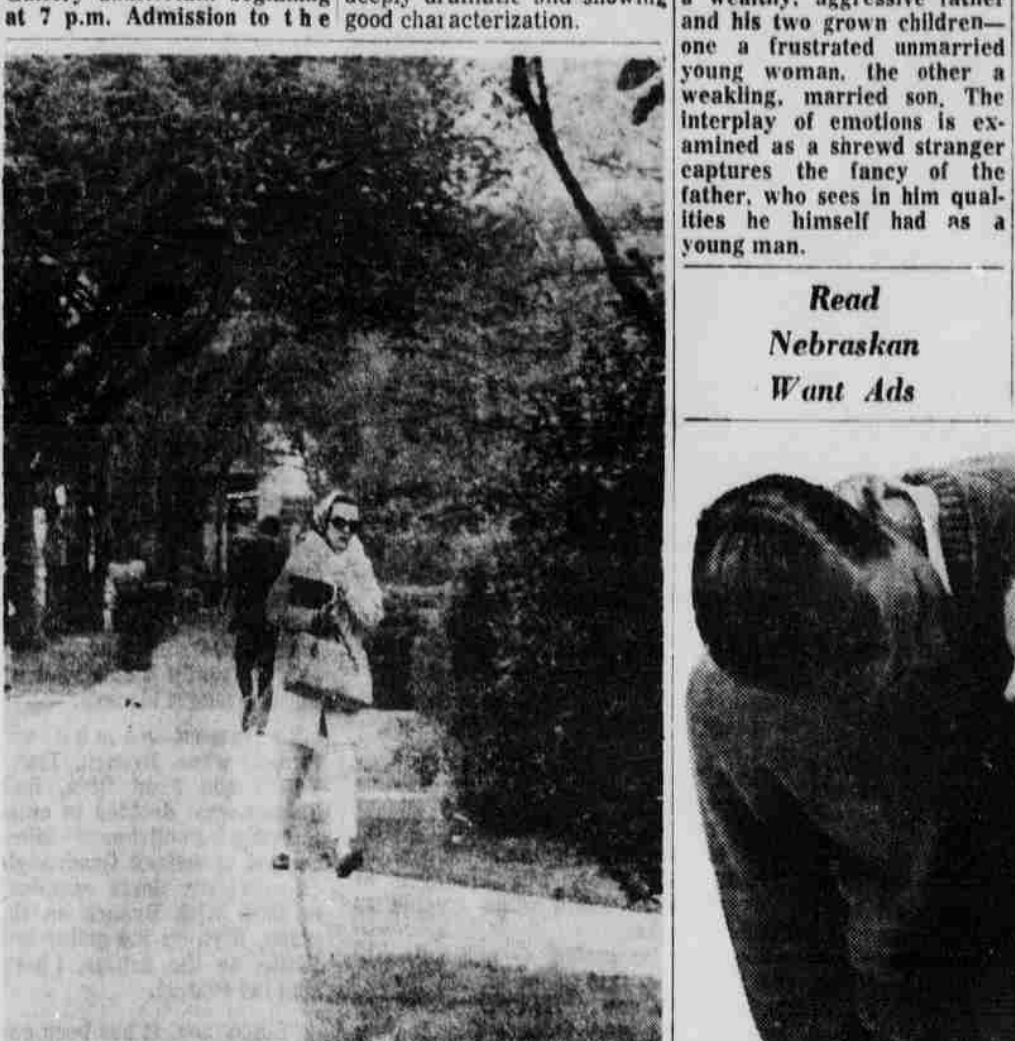
DON'T WORRY . . . if you're not sure what season it is-the weatherman doesn't know either.