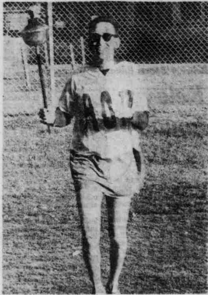
WAN'NA LIGHT? . . . Fraternity men bearing torches ran in relays from Crete Friday to start Greek Week Games.

Sigma Phi Epsilon and Kappa Delta; Beta Theta Pi and Chi Omega; Sigma Nu, Sigma Alpha Epsilon, Alpha Xi Delta and Sigma Delta Tau; Phi Gamma Delta and Alpha Delta Pi; Farmhouse and Kappa Alpha Theta; Tau Kappa Epsilon, Alpha Tau Omega and Kappa Kappa Gamma.