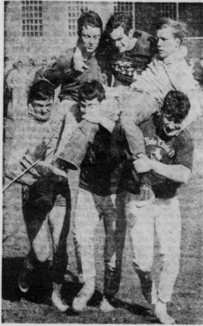
GREEKS . . . pile two high and three across for the Pyramid Race.