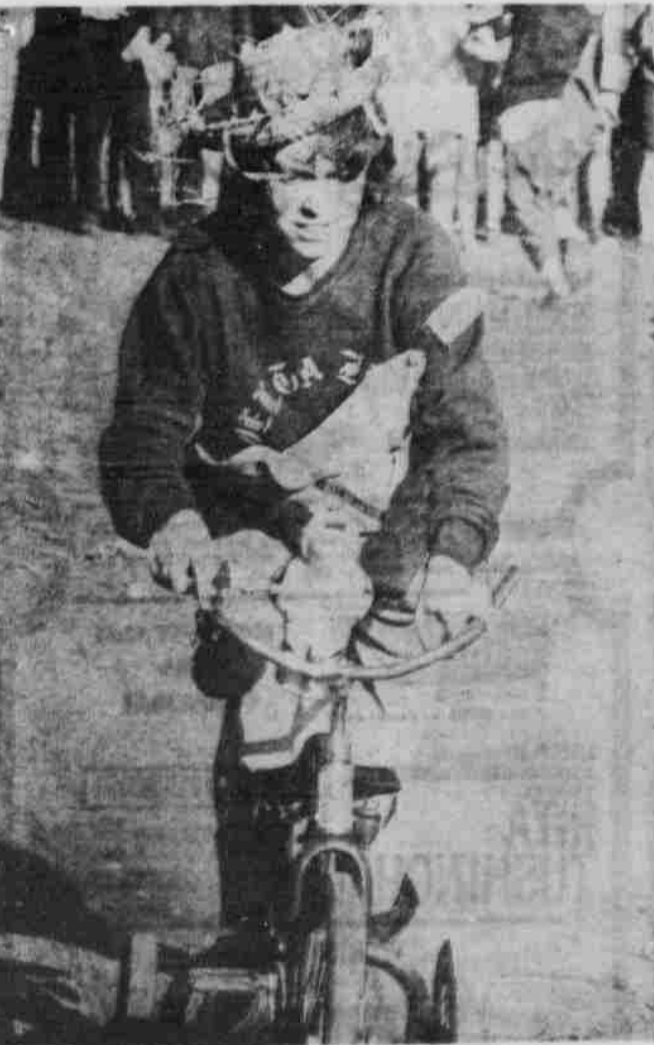
ONE WAY . . . to solve parking problem on campus? No, the Greeks just boarded tricycles in an effort to win the Obstacle Race, part of the Greek Week Games.