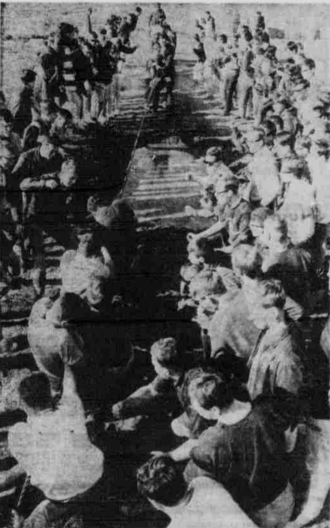
BRAWN Vs. BRAWN . . . Greeks try like crazy to make sure they're not the ones who end up in the drink in the Tug-of-War.