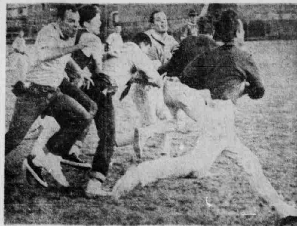
DU's... sweep end for TD.

The team that hardly won a game in two years is the all-university intramural football champion. Delta Upsilon cruised to a 24-6 victory over the Misfits, a team composed of independents living off campus, for the title Nov. 19.