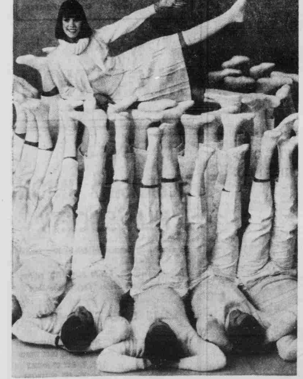
The young bucks of America go clean-white-sock in the new crew Adler calls Adlastic

Meet the revolutionary crew of 65% lambswool plus 35% nylon with spandex for 100% stretch. Up and down. This way and that. That's Adlastic with the give to take on all sizes 10 to 15 and last far longer and fit far better. Size up Adlastic in 28 clean-white-sock colors. Clean-white-sock? The now notion with it even without the wherewithall. Whatever, get Adlastic at stores where cleanwhite-sock is all yours for just one young buck and a quarter.