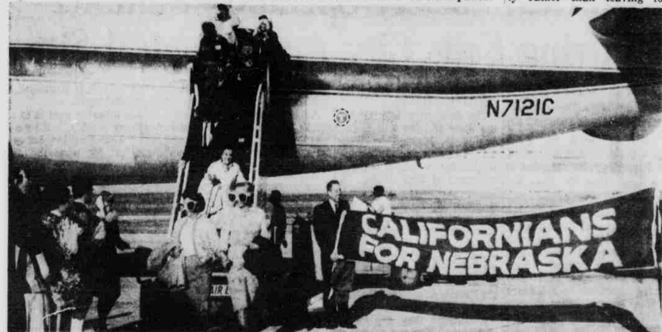
The active California alum group now makes it an annual event to return to the University for Homecoming.