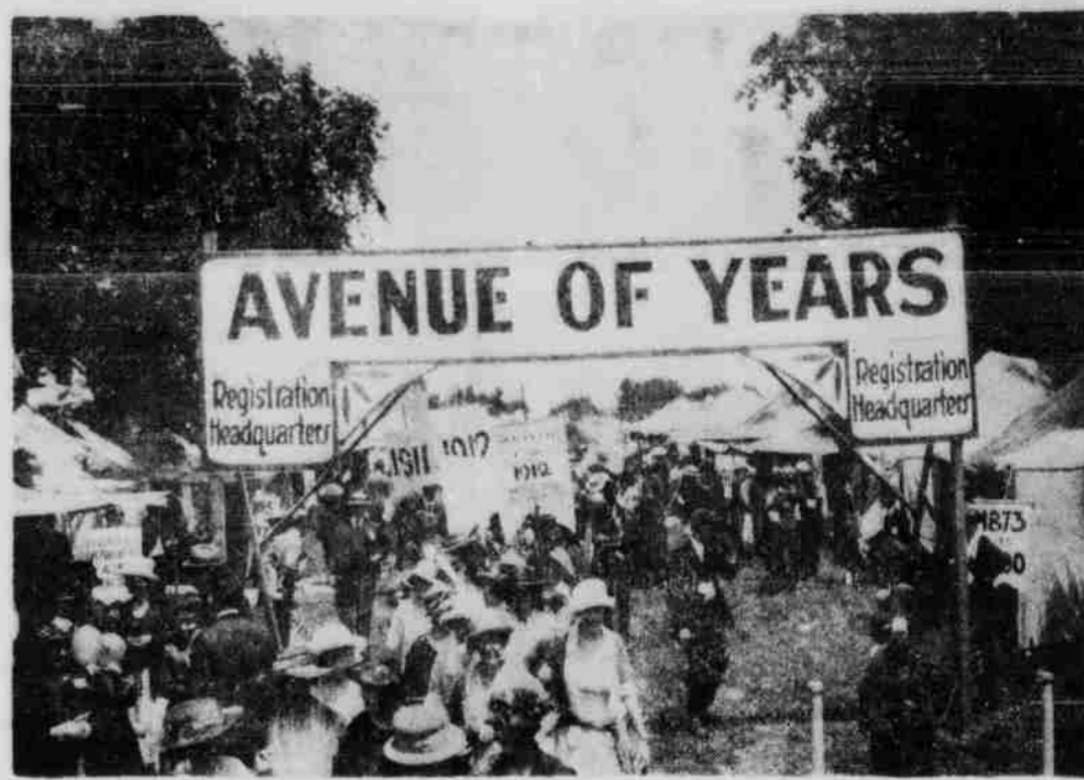
The Alumni Roundup, which was begun in 1922, is now an annual event during which many alumni return to the University for a visit.

They then receive $3,750 stipends above their regular state salary, he said. The purpose of this program is to encourage outstanding professors to stay at the University rather than leaving for