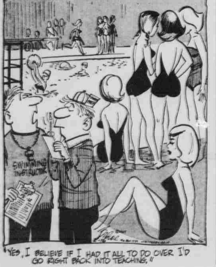
"YES, I BELIEVE IF I HAD IT ALL TO DO OVER I'D GO RIGHT BACK INTO TEACHING."