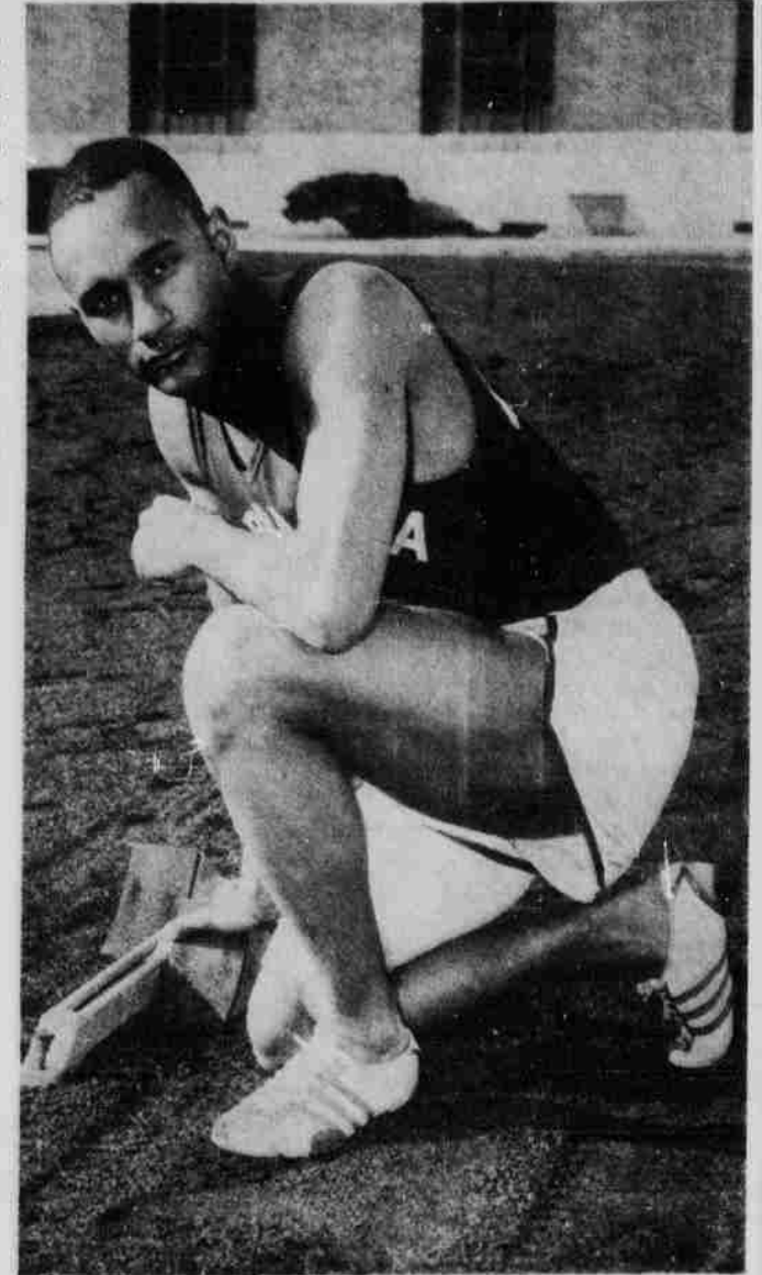
Green . . . Soph readies for action at Kansas Relays.

day affair, will feature some of America's top track talent.