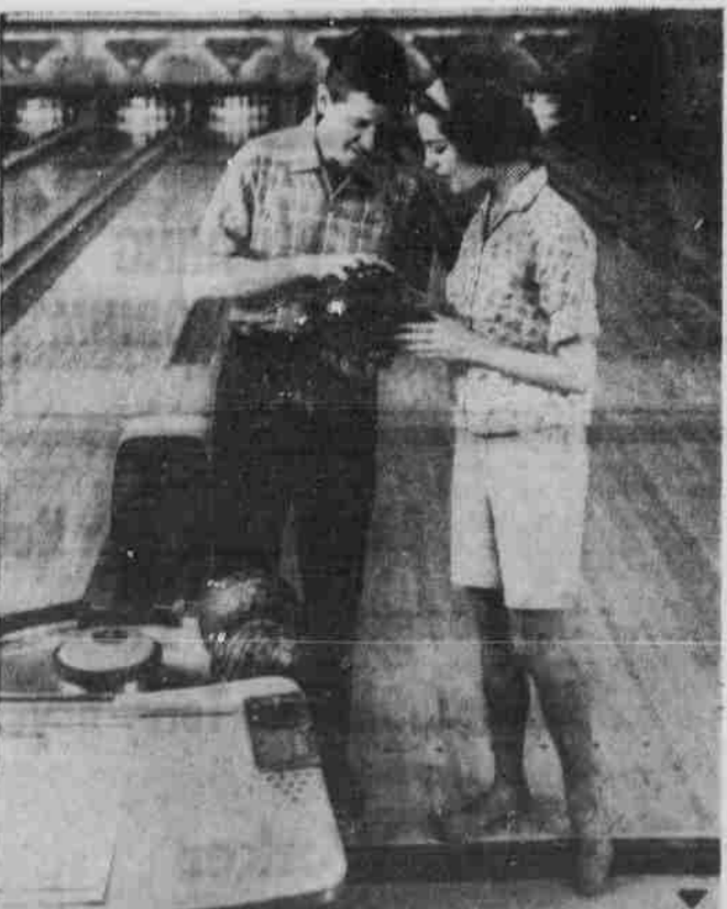
ROLLING IN CLOVER is a reality in McGregor's sweet clover dacron and cotton print shirt jac. Shirt has roll-up sleeves for comfort and bowling ease. Bermudas are exclusive linen-look linspand with a wee bit of stretch. Bowling shoes by AMF.