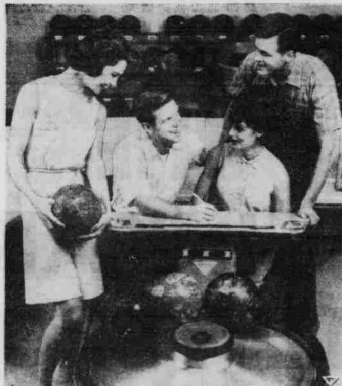
GREAT FOR A DATE! Bowling is fun, fashionable and inexpensive, too. With the college girl in mind, fashions are now designed by McGregor-Doniger with AMF Fashion Line accessories to match.

VERSATILE SKIRT for casual comfort transforms Bermuda shirt in shorts ensemble into a solid and print combination that's great for a bowling date. Dacron cotton and lycra skirt features zip-front. About $14. Shoes by AMF.