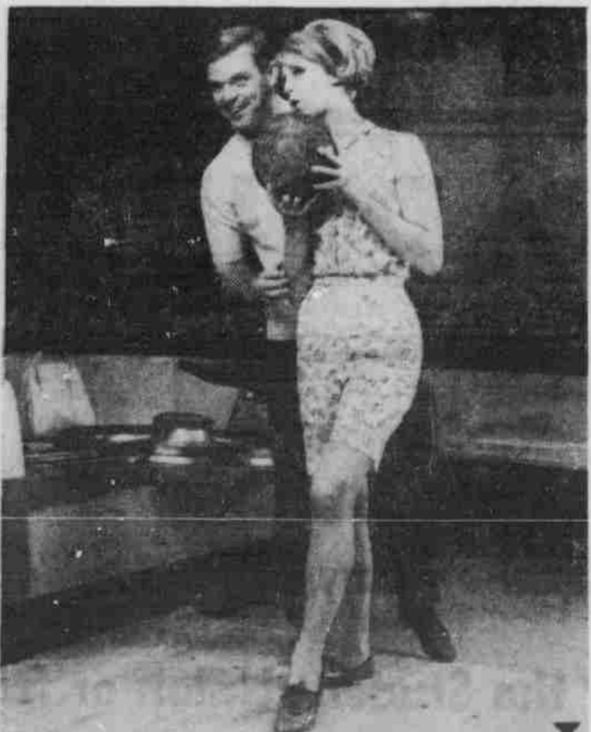
BOWLING PLEASURE in Sweet Clover dacron and cotton print Bermudas, about $11; shirt, about $7. From the Spring '65 "Her" McGregor Pro Shop Collection of active sports fashions approved for bowling by AMF. Shoes and bowling ball from the AMF Fashion Line.