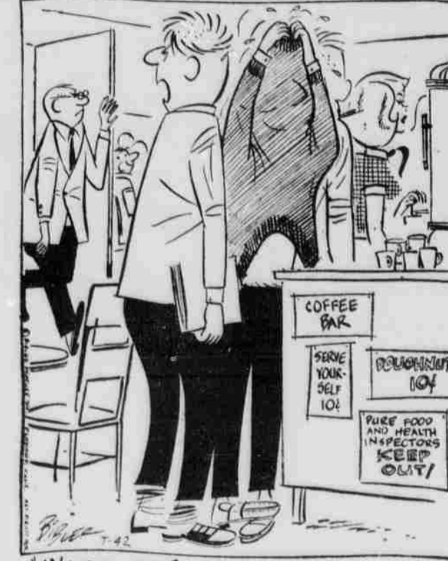
"WHAT'SAMATTER? YA CUT HIS CLASS AGAIN?"