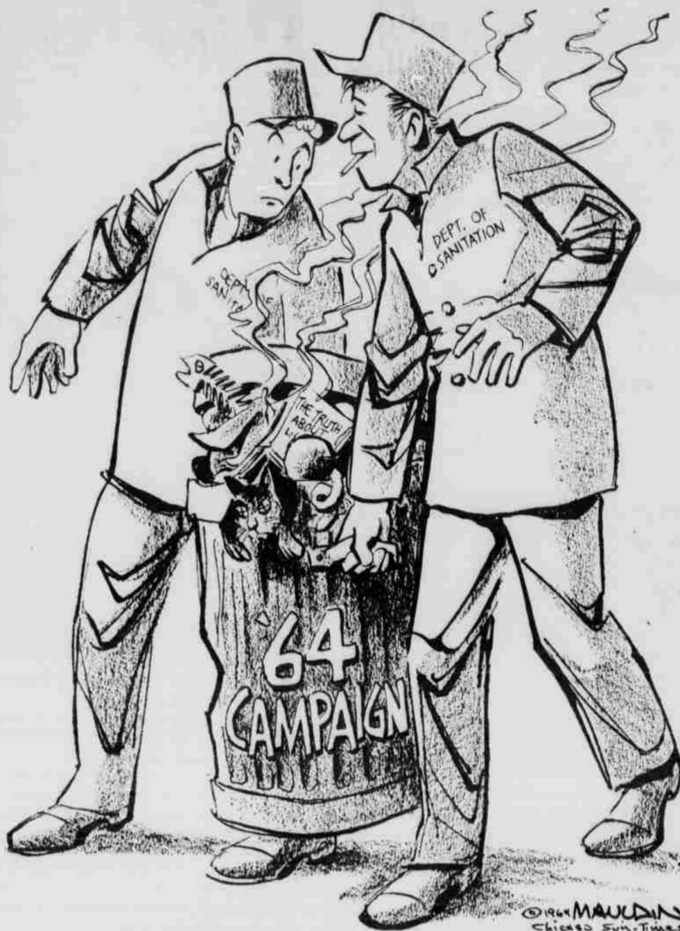
"THINK OF THE MONEY INVESTED IN ALL THIS."