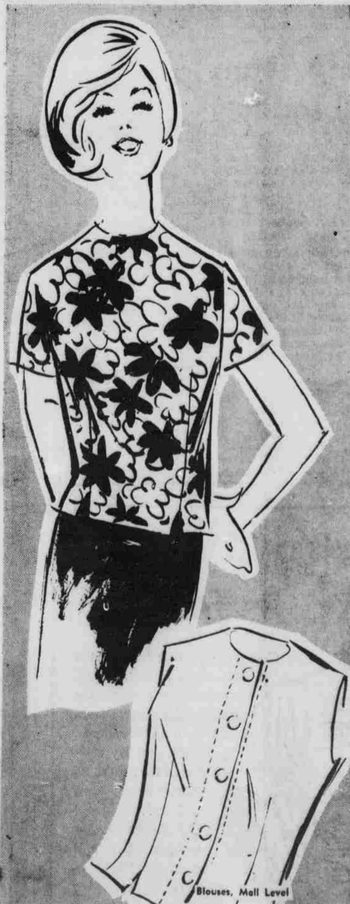
Blouses, Mall Level