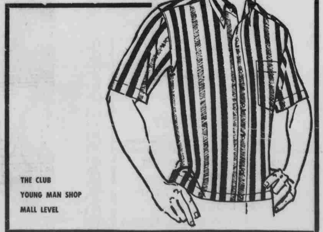
THE CLUB YOUNG MAN SHOP MALL LEVEL