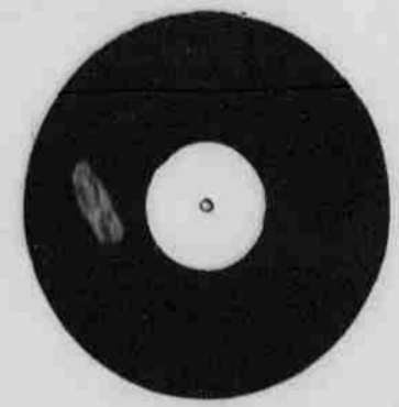
TUNE SHOP • LOWER LEVEL