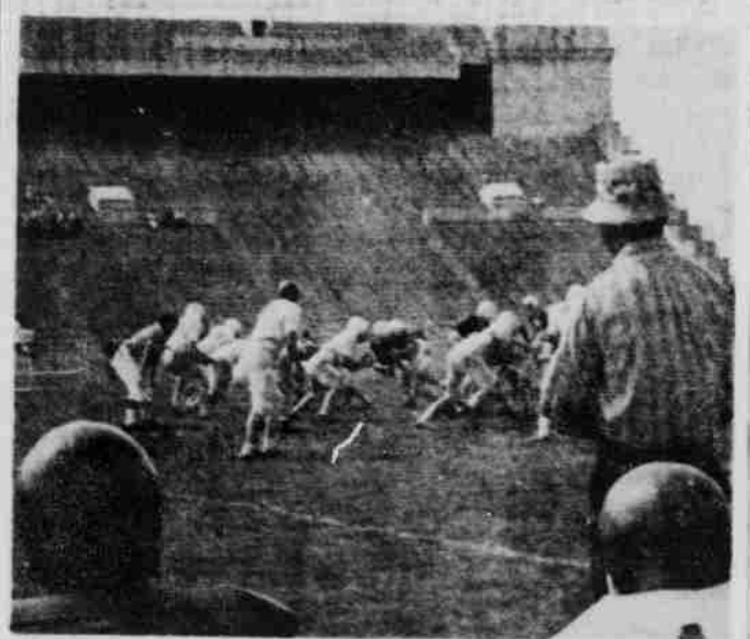
SIDELINERS WATCH SCRIMMAGE — Husker footballers wait their turn to go into the scrimmage held last Saturday. The Red team has the ball at this point in the game.

Nebraska now stands at 2-10 in the conference and Colorado is 5-7. The Huskers travel to Kansas State next weekend for another three game series.